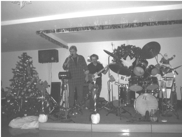
City Limits with a special guest singer ??? at the Adults Christmas Party.