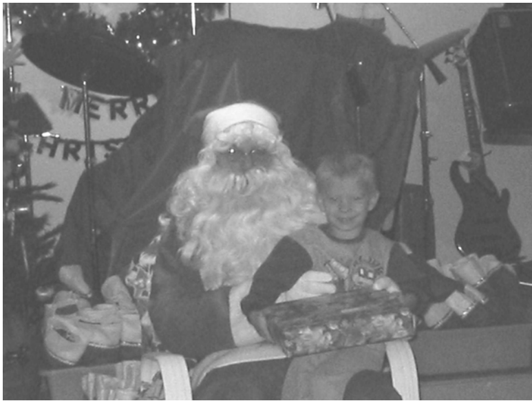
Santa gives out gifts to the children.